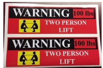
Power Red Machine:

In solidarity, LeCora Shorter VP, Health and Safety, Local 5103